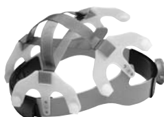
Ratchet Suspension MODEL 3RW3