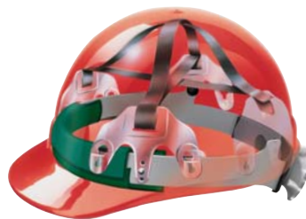
SuperEight suspension with non-slip/non-strip ratchet (replacement MODEL 3RW3 )