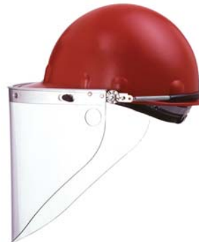
Peak mounted bracket with 4199CL Window MODEL FH66

FM70 (not shown) is for fully dielectric applications.