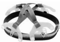
TabLok Suspension MODEL W3F