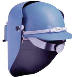
Adjustable Speedy Loop Mounting System MODEL 5000

For frequent on/off use with protective caps. The Speedy Loop is fully adjustable to fit any style of hard hat. Welding helmets, faceshields and goggles may be mounted while the cap is on the head. No tools or modifications required. (Does not affect ANSI rating.)