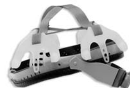
SwingStrap Suspension MODEL 3SW3