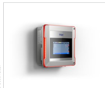
Dräger REGARD 3000 in the event of a gas alarm