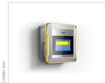
Dräger REGARD 3000 in the event of a failure or fault