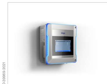
Dräger REGARD 3000 in normal operation