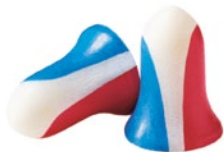
Max® USA Patriotic red, white, and blue colors