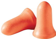
Max Small® Comfort for smaller ear canals