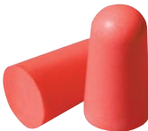
X-TREME® Tapered design for comfort