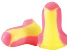
Laser Lite® Highly visible protection