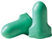
Max Lite® Low pressure foam for comfort