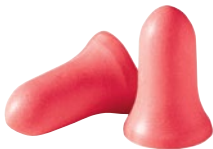
Max® Highest NRR in disposable

An economical and convenient choice for work situations that demand a high degree of comfort, or where hygiene presents a problem for reuse. Formable foam is also THE material of choice when highest attenuation is required.